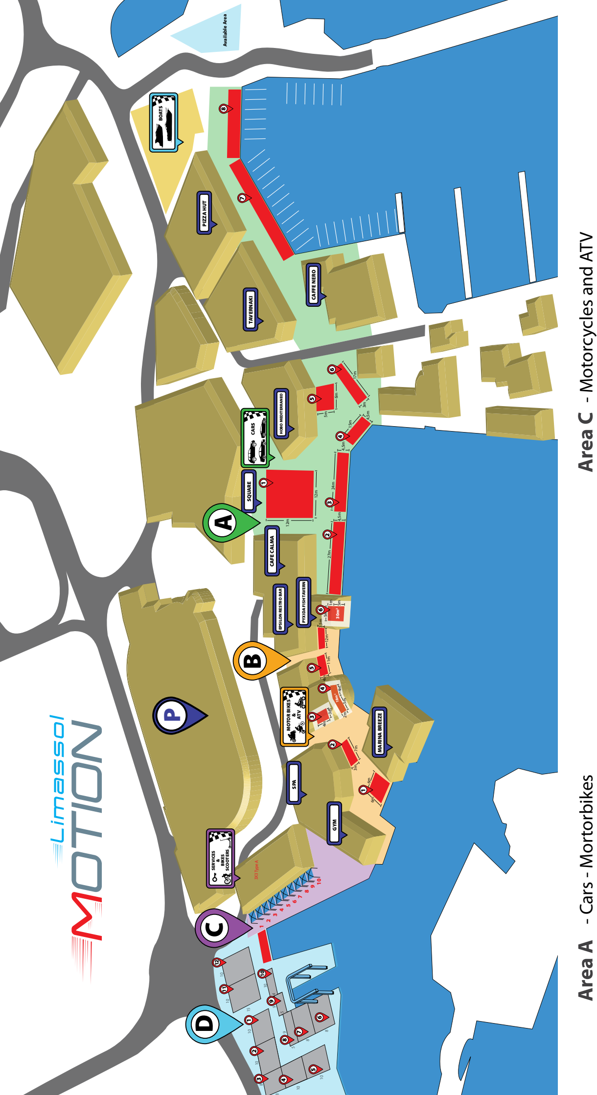
Area D - Bicycles, Scooters, Services & Products